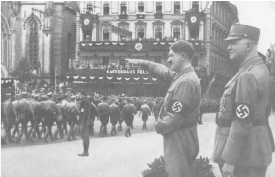
Hitler reviews SA (Brownshirt) units shortly after taking power, Leipzig, 1933.

That the reformists, after the defeat, would be happy if Hitler were to permit them to vegetate legally until better times return, cannot be doubted. But unfortunately for them, Hitler — the experience of Italy has not been in vain for him — realises that the labour organisations, even if their leaders accept a muzzle, would inevitably become a threatening danger at the first political crisis. ■