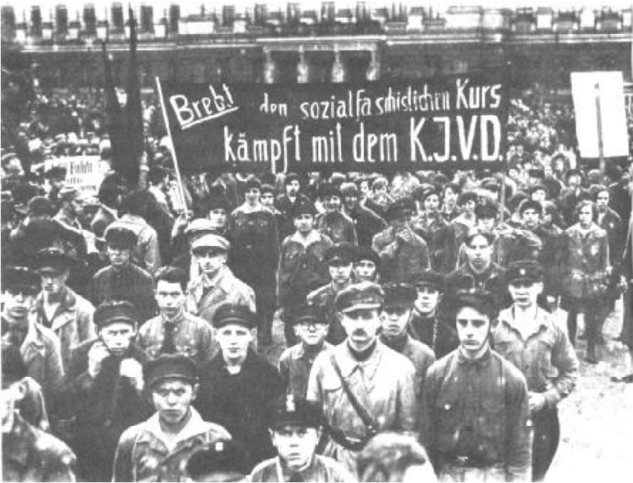
Communist demonstration in Berlin. The banner reads: “Break with the social-fascist course, fight with the KJVD [Communist Youth]”.

clash between the proletariat and the fascist petty bourgeoisie — two camps which together comprise the crushing majority of the German nation — these Marxists from the Vorwärts yelp for the night watchman to come to their aid. They say to the state: “Help! Intervene!” ( Staat, greif zu! ) ■