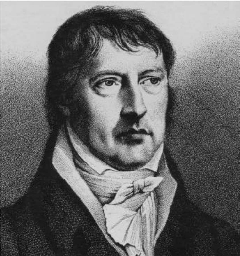
Georg Hegel (1770-1831)

Further, we find upon closer investigation that the two poles of an antithesis, positive and negative, e.g., are as inseparable as they are opposed, and that despite all their opposition, they mutually interpenetrate. And we find, in like manner, that cause