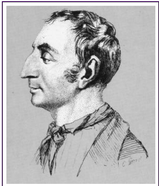
Henri Saint-Simon (1760- 1825)